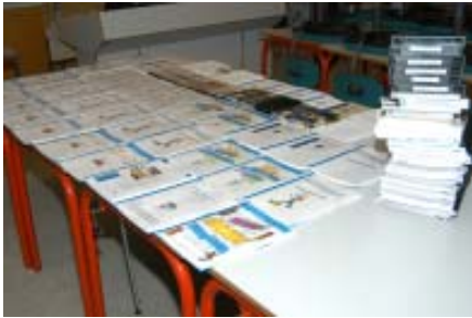
The collection of materials from the BP-BLTM project sent with the final report

Latest News: Pools a new Leonardo II project has passed the evaluation with flying colours, the project has now been recommended for funding and the final hearing at the EU commission is underway in Brussels