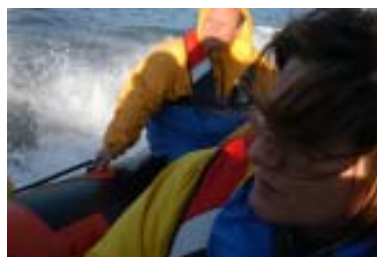
The now extended BP-BLTM team has set course towards a new project titled Pools

The students have to decide on a suitable location for a new machine tools factory, they are supplied with four options and have to compare taxes, infrastructure, available employees etc Download the simulation from www.languages.dk/methods