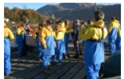
The BP-BLTM team ready for new adventures