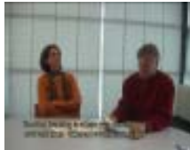
Screen shots from the BP-BLTM DVDs