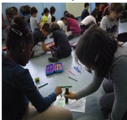
Children in Bussero, Italy working with a scenario from Spain

The class acquired a new vocabulary by amusing and involving activities: singing, drawing, painting, cutting. The most interesting thing was the pointillism technique: some children took 5 felt pens all together and filled the forms (smart and fast system!).