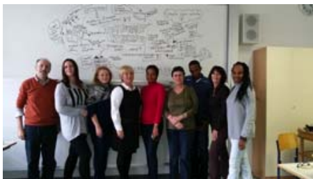
The METHODS teams coming from Denmark, France (Guadeloupe), Malta, and Slovenia met in Celje, Slovenia for a very busy third project workshop

In November 2014 the team of S'GT Celje (Secondary School for Catering and Tourism) hosted the third METHODS partner meeting in Slovenia. The agenda was busy, covering the review of the past work, feedback from course piloting, discussions on current tasks, ideas for improvements, interim report issues and tasks for the next 6 months. The partners also observed a demonstration lesson using the Simulation method which was prepared by the teachers and students of our school. Many useful comments and new ideas came up during the debriefing session. The representative of the National Education Institute of the Republic of Slovenia was invited to take part in the discussion about possibilities for piloting the METHODS course and promised support to the Slovenian team. S'GT Celje will be included as a "model school" in the project Enriched Foreign Language Learning, coordinated by the National Education Institute. Thus our team will be given the opportunity to implement the METHODS course within a wide network of Slovenian schools included in this project on the national level. The news and photos from the meeting were posted on the our school webpage and on Facebook and shared via personal pages of the project team members.