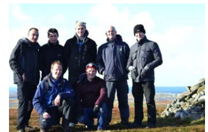
The Irish team from Ulster visiting the Scottish Hebrides

The Irish team from University of Ulster have been using Clilstore to document their recent visit to the Scottish Hebrides.