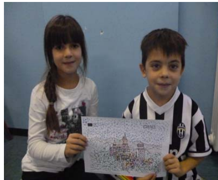
Children from Italy learning through a scenario made in Spain

things that all of them love: enjoying themselves and learning about subjects they are interested in. I have never met a kid who didn't want to have fun, nor a person who didn't want to learn more about those things they were interested in. These are two of the most important things we have in mind at Zola school when we are preparing a new scenario. How should we prepare a scenario to explain the same topic to such different children?