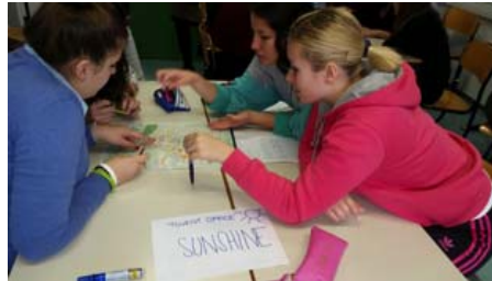
Students experiencing one of the language learning methods

The five language teaching were also disseminated at the ECVET thematic seminar "Involvement of teachers and trainers in the implementation of ECVET" in Warsaw, Poland (9-10 December 2014) by our teacher Vid Burnik, who took part in the seminar.