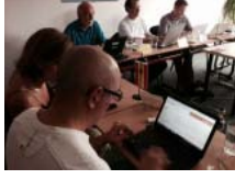
Pools-3 team members in action in Brno