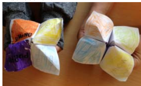
Chatter boxes made by pupils in Odense and used for learning languages

The main goals in math were to learn the terms for geometric shapes (eg. square, triangle, diagonal line, corner) and to follow an instruction.