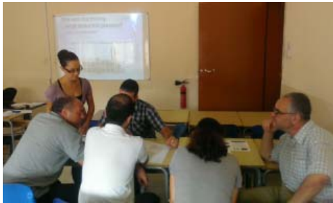
MCAST teachers in action working with the METHODS

ETI training courses. A large number of teachers from all over Europe, and outside Europe (Russia, Chile, China and Canada) were shown the Methods webpage, and the 5 Methods were explained. All the teachers were encouraged to follow the Methods Facebook page to be kept informed of any updates to the website. The number of teachers who listened to the talks since April, and received a Methods brochure totaled 220.