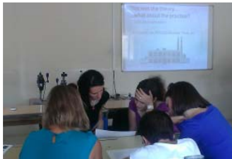
MCAST training session working with a simulation

Based on the final results, it was evident that the participants benefitted from these sessions and are interested in using these methods with their students.