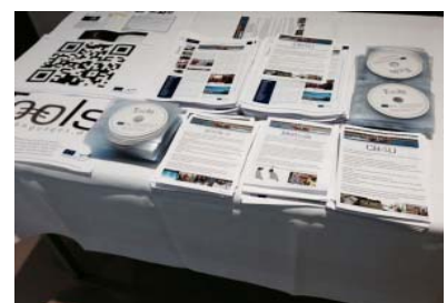
Exhibition of the pools projects during Eurocall 2014 in Groningen