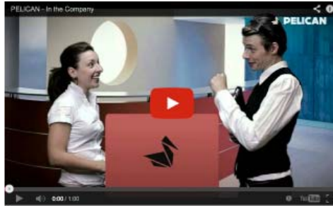
The Pelican team has prepared a new video which will be used during CALL courses

The Czech team has prepared a new clip for the Czech video collection it can be used as an available material for new language learning units of computer assisted language learning method. This one is the dialogue between the receptionist and visitor of company who looks for the director.