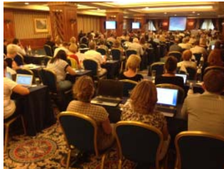
TOOLS Newsletters were placed on all chairs ready for the EfVET conference opening session